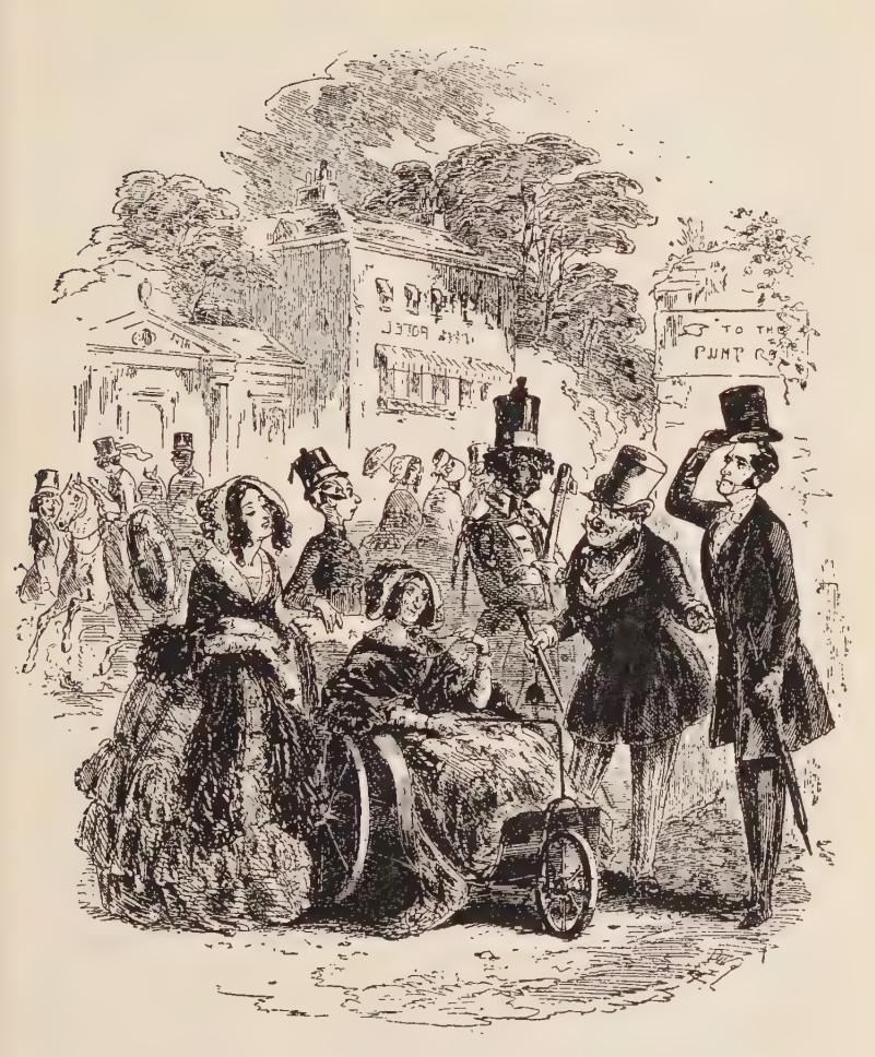
Major Bagstock is Delighted to have that Opportunity.